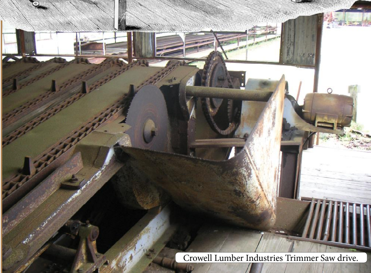
Crowell Lumber Industries Trimmer Saw drive.